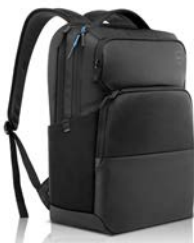
DELL PRO BACKPACK 17 | PO1720P

Experience realistic images like never before on the award-winning, world's first 31.5" 8K monitor featuring Dell PremierColor.