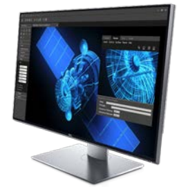
DELL ULTRASHARP 32 8K MONITOR | UP3218K

*CalMAN license required, sold separately