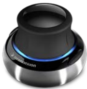
3DCONNEXION SPACEMOUSE WIRELESS

Multi-task seamlessly across 3 devices with this premium full size keyboard and sculpted mouse combo with programmable shortcuts and 36 months battery life.