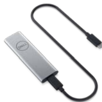
DELL PORTABLE SSD, USB-C 250GB

Protect your notebook and accessories with this lightweight backpack that is made with shock-absorbing EVA foam and Dell's EcoLoop™ solution dyeing process.