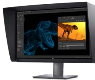
DELL ULTRASHARP 27 4K PREMIERCOLOR MONITOR WITH A HOOD | UP2720Q

3Dconnexion's patented 6-Degrees-of-Freedom (6DoF) sensor is specifically designed to manipulate digital content or camera positions in the industry-leading CAD applications. Simply push, pull, twist or tilt the 3Dconnexion controller cap to intuitively pan, zoom and rotate your 3D drawing.