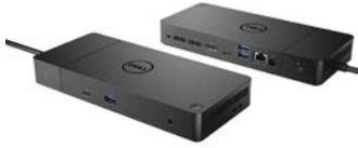
PRECISION THUNDERBOLT DOCK | WD19TB

SMART SOLUTIONS TO HELP YOU WORK MORE EFFECTIVELY.