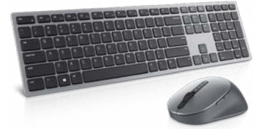
DELL PREMIUM WIRELESS KEYBOARD AND MOUSE | KM7321W

Dell's most powerful dock delivers the ultimate productivity experience for 7000 Series mobile workstations. Charge your system faster, display up to three 4K monitors, and connect your peripherals via a single cable with dual USB-C connectors.