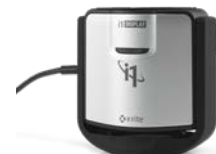
X-RITE COLORIMETER 1 DISPLAY PRO The iDisplay Pro ensures a perfectly calibrated and profiled display while delivering the speed, options and flexibility needed to maintain color accuracy.

*Based on Dell internal testing using included cable and connected to Dell PCs supporting USB 3.1 Gen 2.