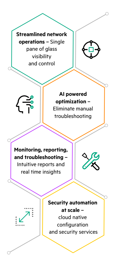
Figure 1. Key features of HPE Aruba Networking Central