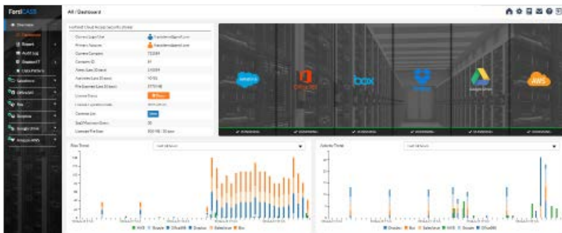
Figure 1: FortiCASB dashboard.

While built-in Secure SD-WAN provides security and network reliability, FortiCASB ensures user behavior and data stored in major SaaS applications are protected and free from risk. On-demand data scanning validates data leakage policies and scans for threats to ensure everything meets existing business policies. Out-of-the-box reporting offers predefined reports for standards including SOX, GDPR, PCI, HIPAA, NIST, and ISO/IEC 27001 and speeds up audits.