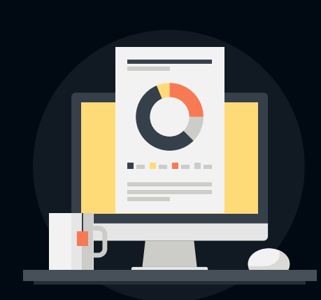
Improved Cost Predictability