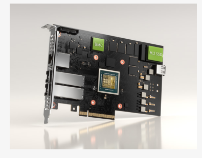
BlueField-3 DPU – 2x\ 200Gb/s\ FHHL form factor